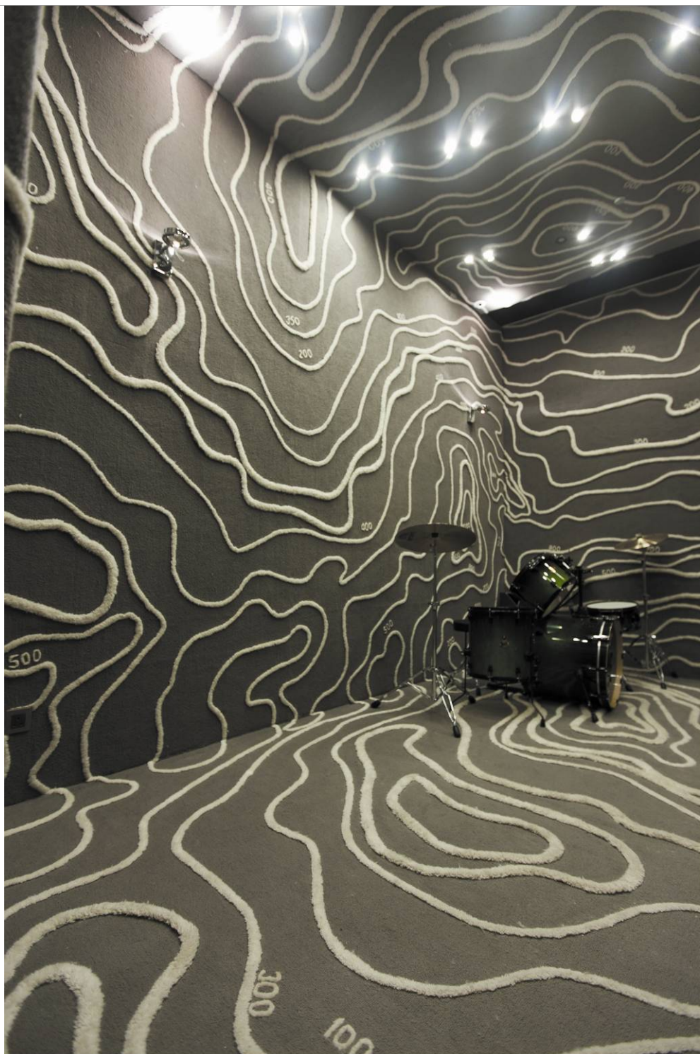
YOHO MIDTOWN RESIDENTIAL CLUBHOUSE