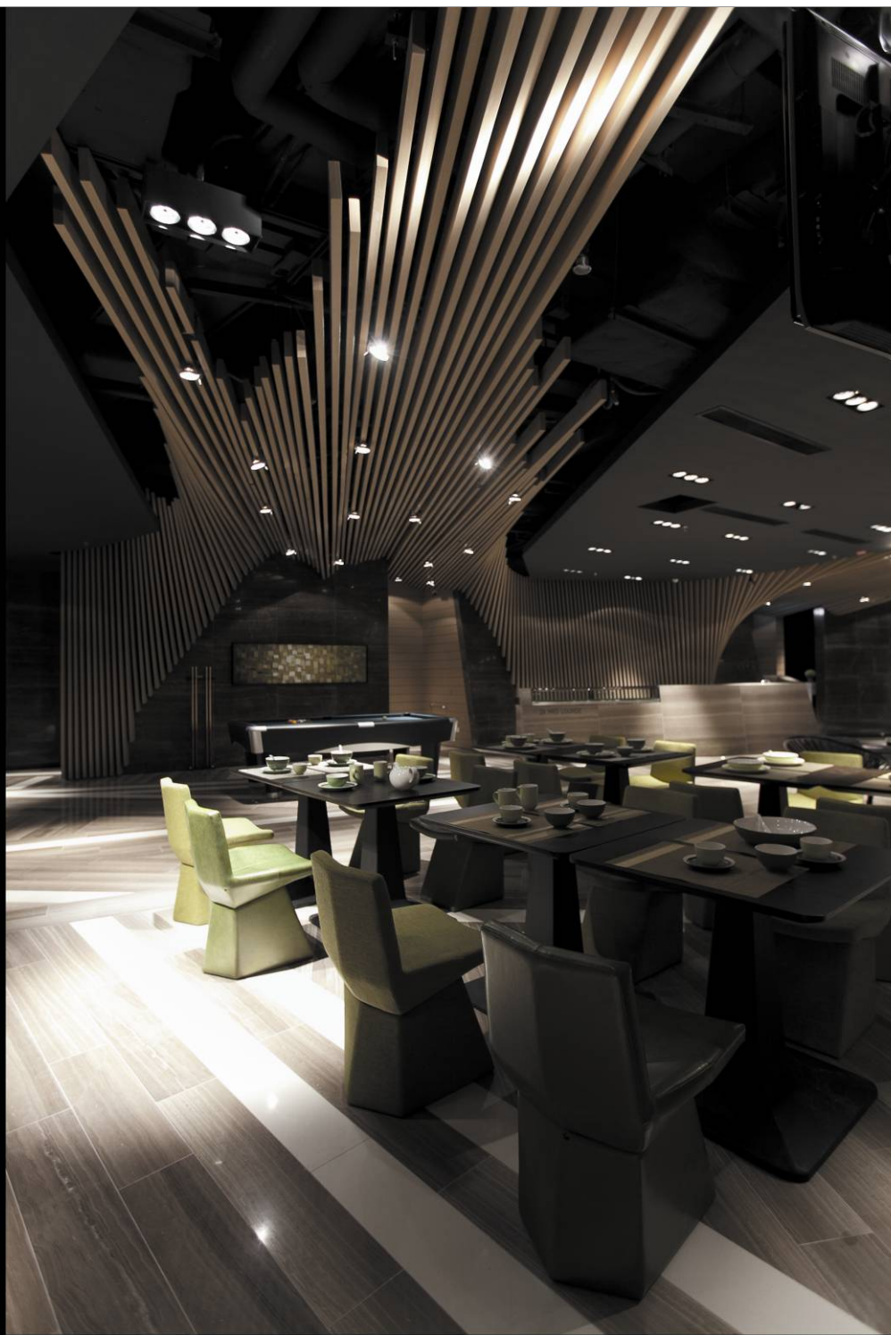
YOHO MIDTOWN RESIDENTIAL CLUBHOUSE