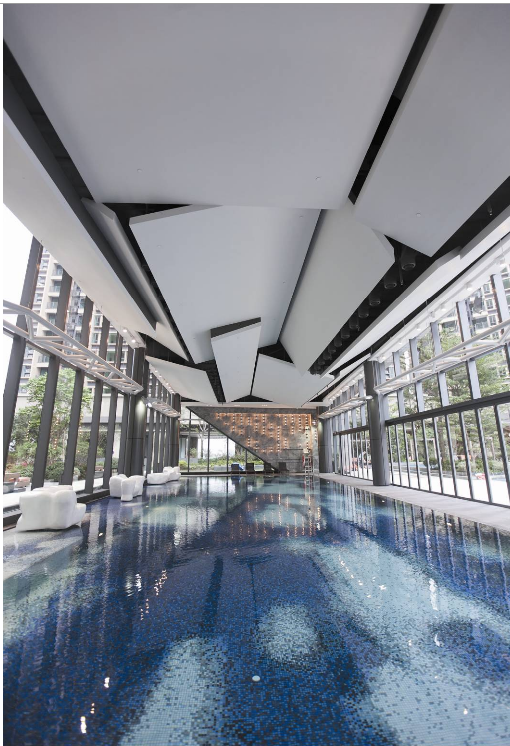
YOHO MIDTOWN RESIDENTIAL CLUBHOUSE