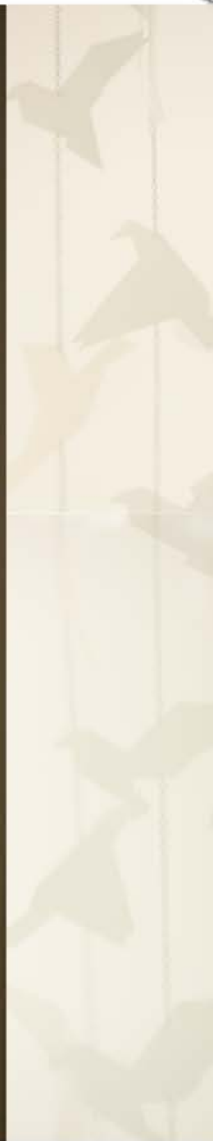
摺紙轉心念 祈福往淨土