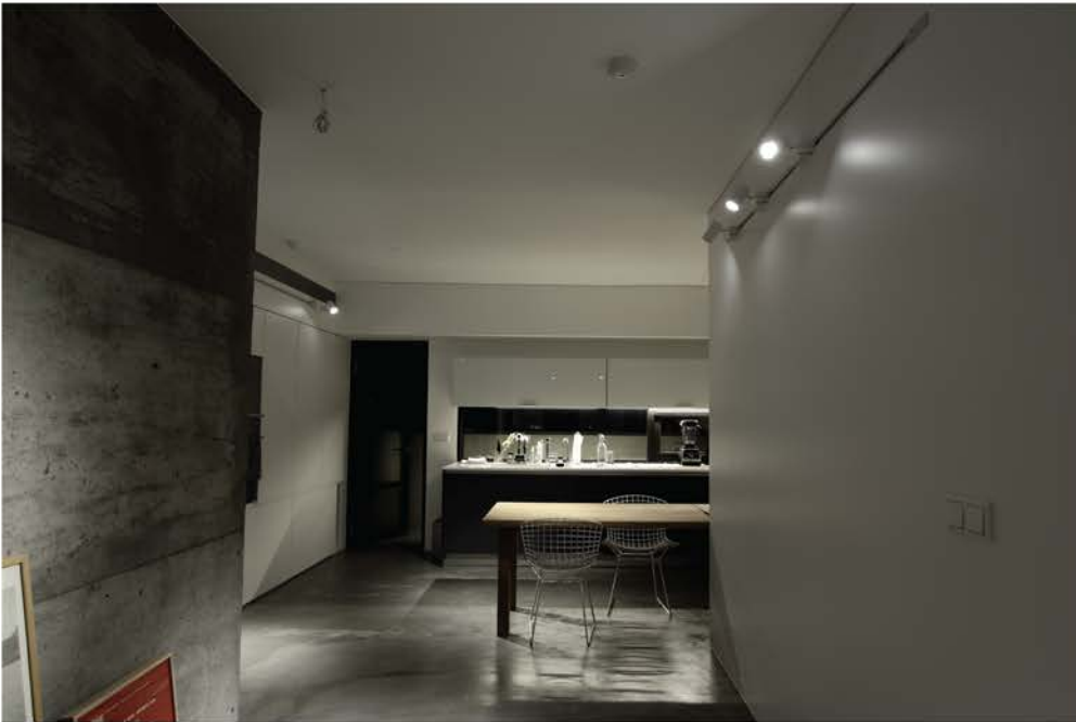
The concrete wall guiding your vision into the kitchen.