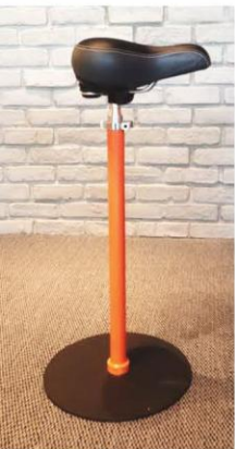
腳踏車設計椅 方便客人暫時倚靠 Bicycle design chairs are easy for guests temporarily lean to experience products