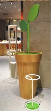
舊手機回收箱 體驗產品 以大盆栽造型 製造童趣感

Old cell-phone-recycling boxes are shaped into large pots to create the sense of children's fun