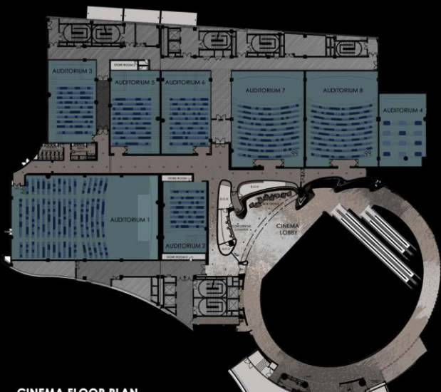
CINEMA FLOOR PLAN

BLUE AND GREEN ARE THE TWO COLORS THAT ONE WOULD ASSOCIATE WITH WHEN THINKING ABOUT THE OCEAN. BREAKING THE SOCIAL NORM, THE DESIGN TEAM GOT INSPIRED BY THE COASTAL GEOGRAPHY, THE STUDY OF THE DYNAMIC INTERFACE BETWEEN THE OCEAN AND THE LAND, PARTICULARLY WAVE ACTION, HENCE THE CREATION OF THIS MAGNIFICENT CINEMA. THE OVAL-SHAPED GIGANTIC LOBBY GREETES THE GUESTS WITH ITS CURVY FORM, JUST LIKE THE COASTAL LINE BETWEEN THE LAND AND THE OCEAN. WAVEFORMS HIDE WITHIN THE WHOLE PERIMETER. VARIOUS LENGTHS OF RECTANGULAR TILES MANIFEST THE FLOORING, WHEN LOOKING FROM AFAR, ARE LIKE THE SEA WATER BEING WASHED ONSHORE, UNDER THE INFLUENCE OF THE GRAVITATIONAL FORCES EXERTED BY THE MOON AND THE SUN AND THE ROTATION OF THE EARTH. POWDER-COATING METAL RODS WERE BUILT ALONG THE LOBBY, SIMULATING WAVE ACTIONS, FALLING AND RISING ACCORDINGLY.