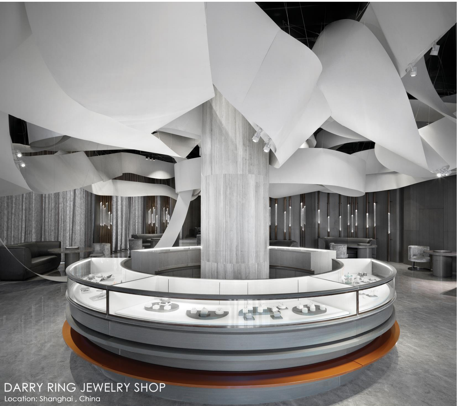
DARRY RING JEWELRY SHOP Location: Shanghai , China