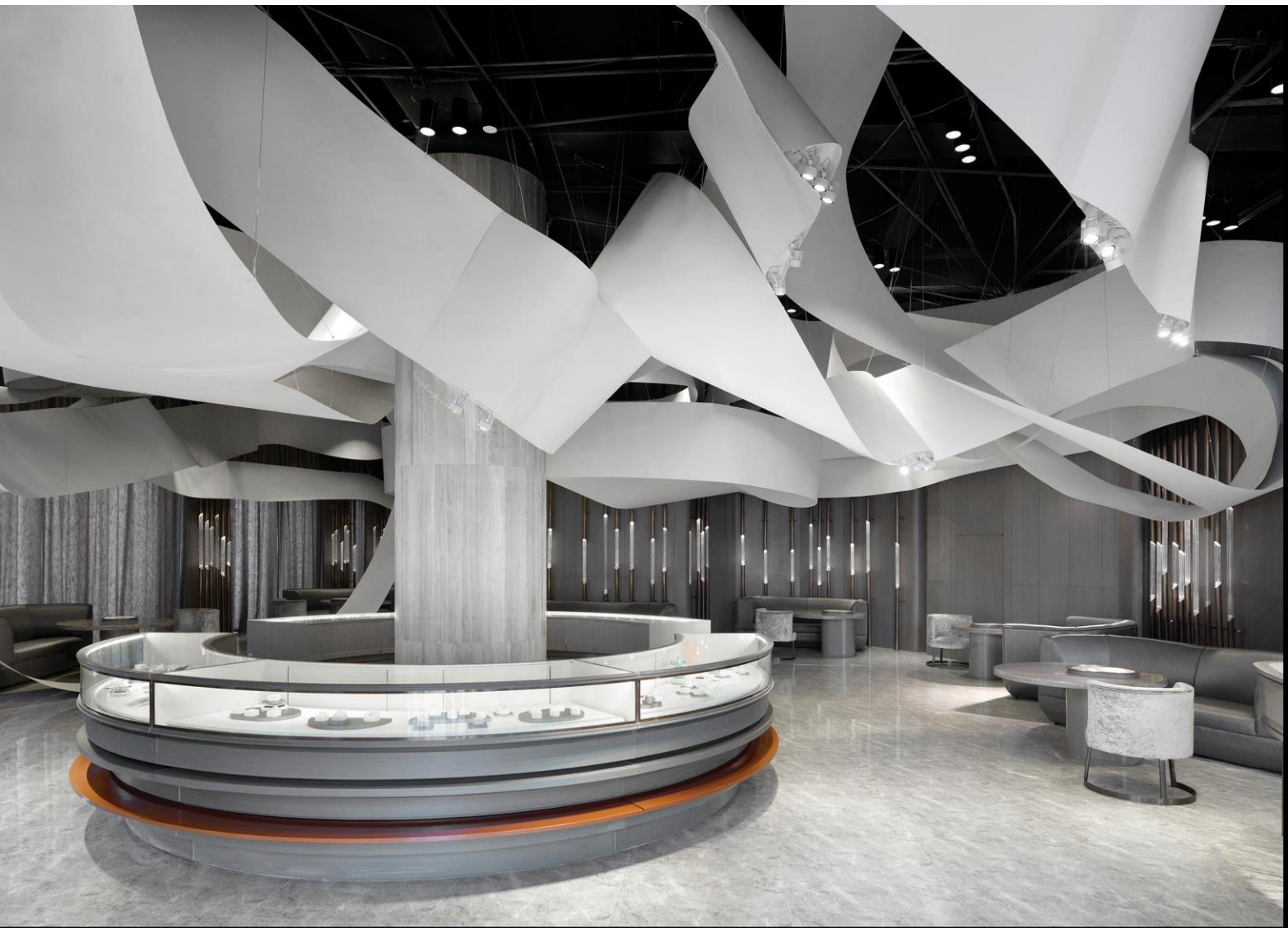
DARRY RING JEWELRY SHOP Location: Shanghai , China